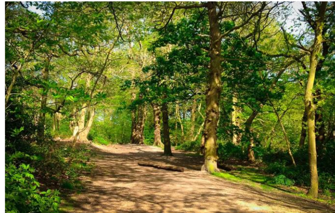
Oxleas Wood – Crown woods lane, SE18