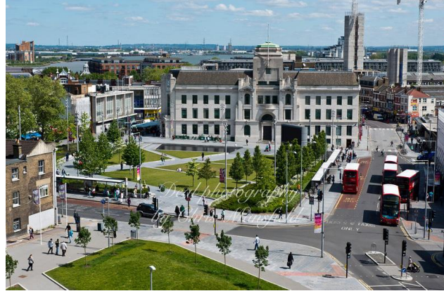
General Gordon Square – Woolwich, SE10