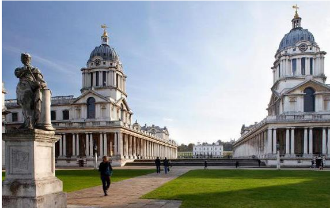
Greenwich Old Royal Naval College and University – Park Row, SE10