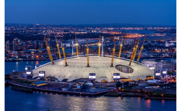
The O2 Arena and shops - Peninsula Square, SE10